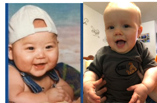
It's the future generations we are protecting

In a 2013 study by the CDC entitled Adolescents, Technology and Reducing Risk for HIV, STDs and Pregnancy", a teen participant stated, "I multitask every single second I am online. At this very moment, I am watching TV, checking my email every two minutes, reading a newsgroup about who shot JFK, burning some music to a CD and writing this message." - 17 year old boy,